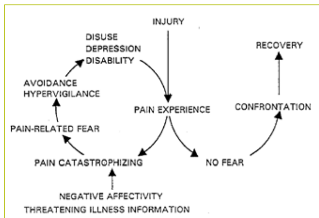
FIGURE 1 The Fear-avoidance model (6).

CLBP. Fritz et al (12) found that FABQ-work subscale may serve as an effective screening tool for estimating risk of prolonged work restrictions. Storheim et al (15) report in their study that a high degree of FAB-work is a strong predictor for not returning to work. Grotle et al (16) compared two different subgroups of the back pain population, a sample of patients with ALBP and another sample with CLBP. The results show that the patient with CLBP reported significantly more FAB than those with ALBP especially regarding FABQ-W. Other studies use FAB questionnaires as a measure of effect of intervention (10, 17).