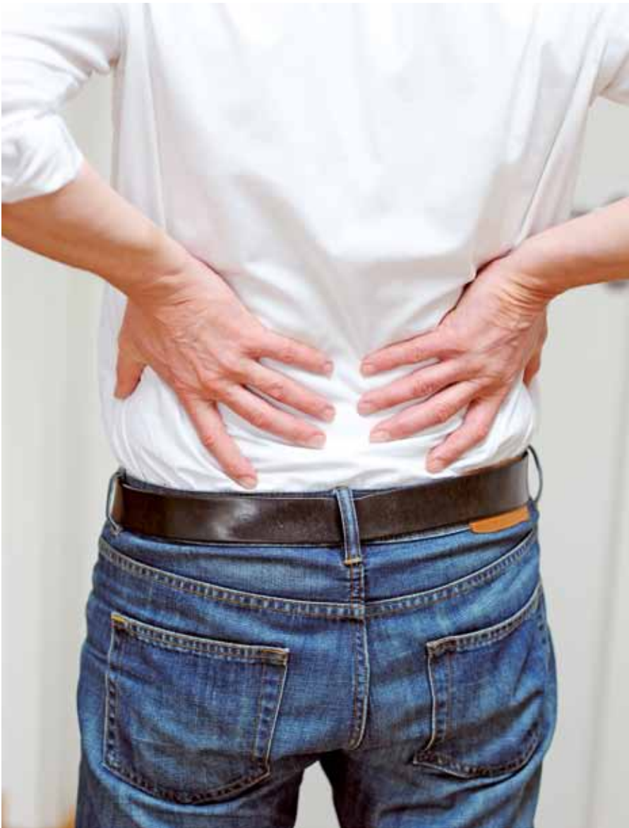
KORSRYGGSMERTER Fear-avoidance beliefs (FAB) er overdreven frykt for bevegelser. Dette kan føre til at man unngår bevegelser og aktiviteter, og dermed bidrar til å opprettholde ryggplagene.

Many patients have more fear about their back pain than necessary.